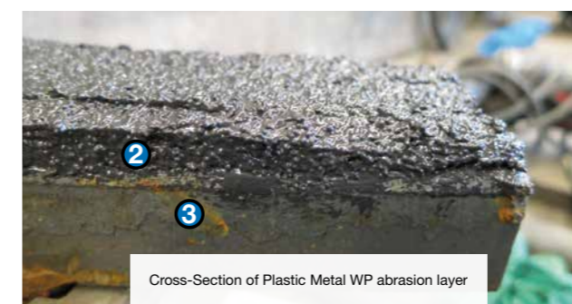
Cross-Section of Plastic Metal WP abrasion layer