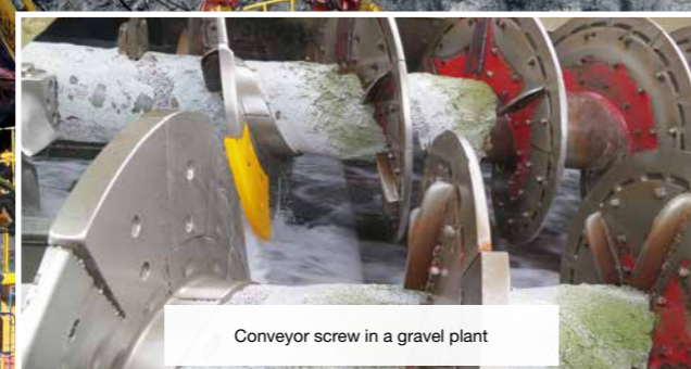
Conveyor screw in a gravel plant